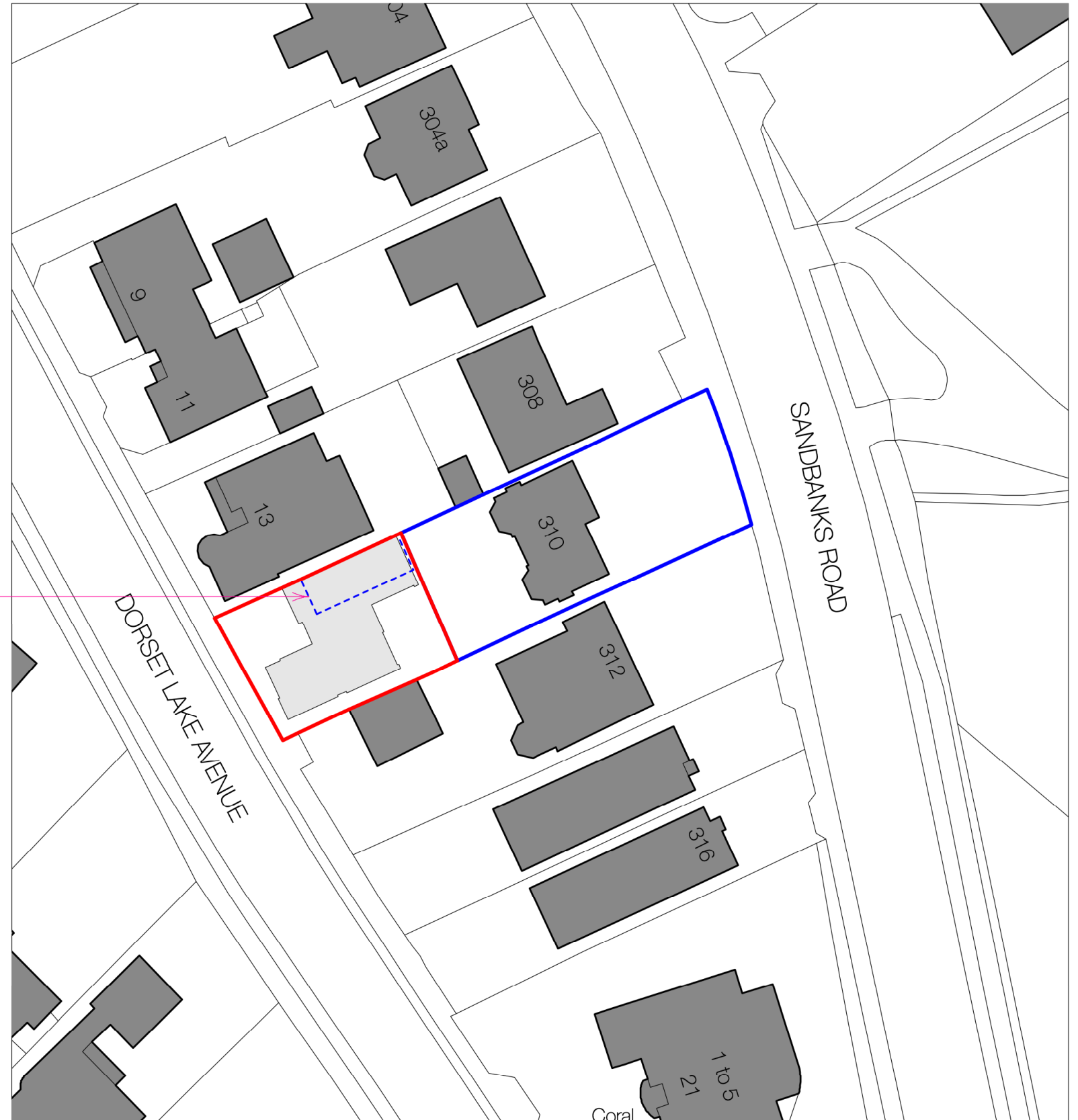
BLOCK PLAN Scale 1:500 @ A3

NOTE, EXISTING GARAGE IS IN POOR REPAIR WITH A STRUCTURALLY UN-SOUND FLAT ROOF WITH NO POSSIBILITY TO ACCOMMODATE WILDLIFE OR BATS AS THERE IS NO AVAILABLE ROOF SPACE, NO HABITABLE ACCOMMODATION AND NO EAVES.