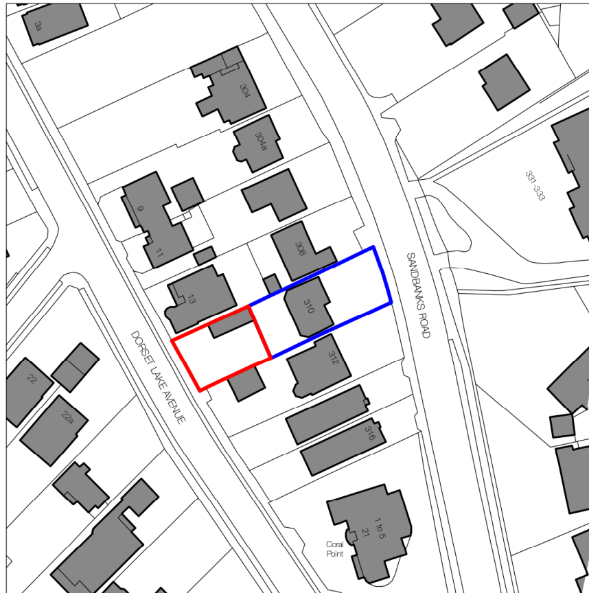
LOCATION PLAN Scale 1:1250 @ A3